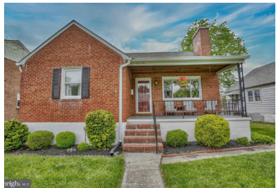
8216 Laurel Drive, Parkville, MD