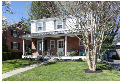
504 Park Avenue, Towson, MD