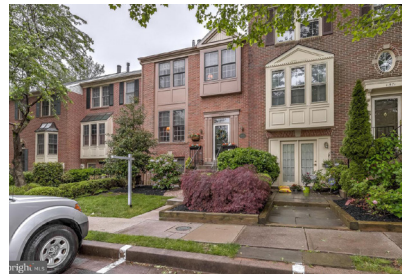
11973 Mays Chapel Road, Timonium, MD