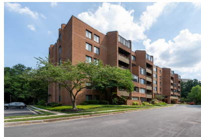
2 Southerly Court, Unit 207, Towson, MD