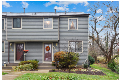
7016 Sherwood Road, Baltimore, MD