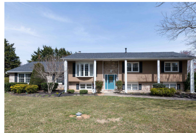
3215 Suffolk Lane, Fallston, MD