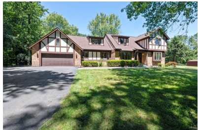
12 Ridgecliff Court, Kingsville, MD