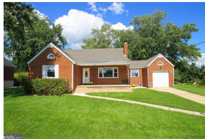
2904 Second Avenue, Parkville, MD