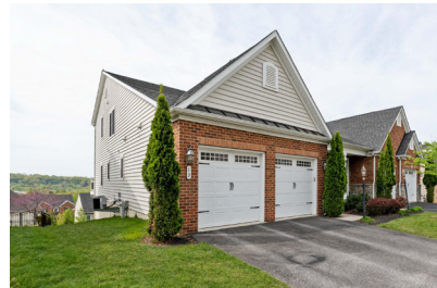
13 Holy Crest Drive, Timonium, MD