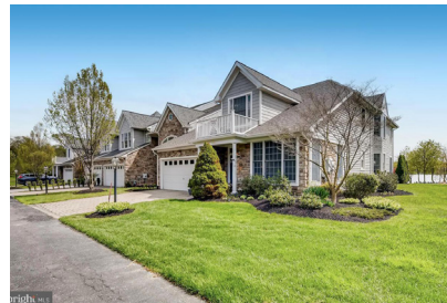
4842 Water Park Drive, Belcamp, MD