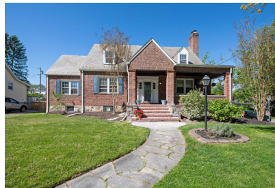
530 Murdock Road, Towson, MD