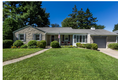
1114 Stevenson Lane, Towson, MD