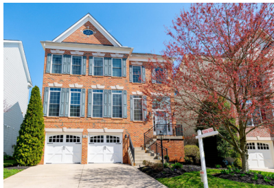
13 Fallstonview Court, Fallston, MD