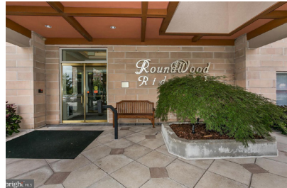
12551 Roundwood Road, Timonium, MD