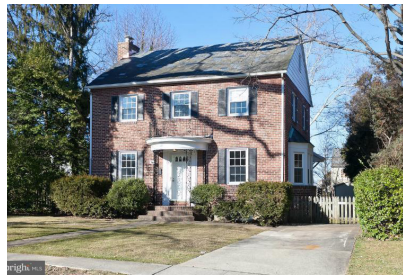
900 Greenleigh Road, Towson, MD