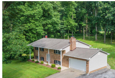
3613 Duxbury Court, Jarrettsville, MD