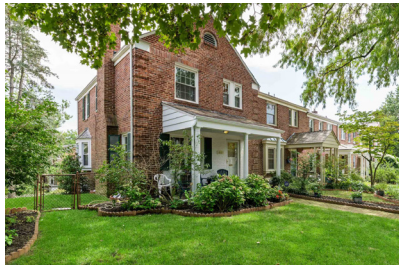
3713 Delverne Road, Baltimore, MD