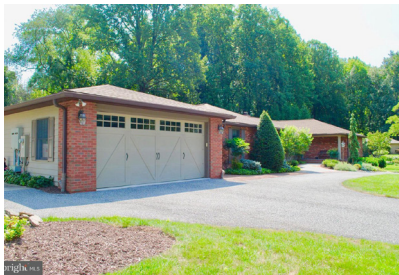
1423 Autumn Leaf Road, Towson, MD