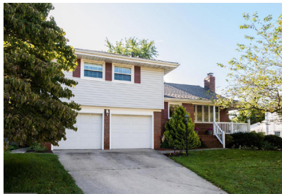
2511 Londonderry Road, Timonium, MD