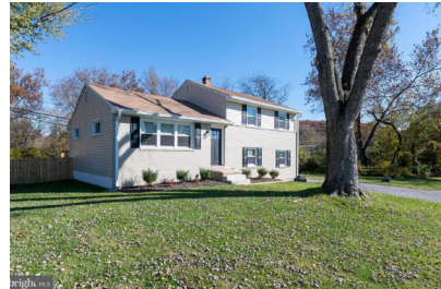
8203 Thornton Road, Towson, MD