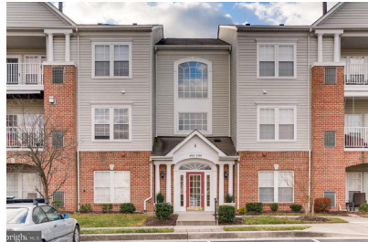
4964 Brightleaf Court, Rosedale, MD