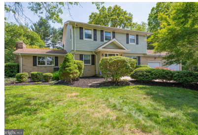
1401 Chippendale Road, Timonium, MD